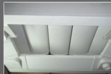
Corner Gutter with Down Pipe